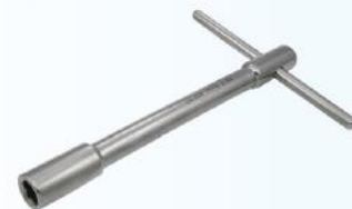
Box Spanner 11mm