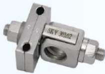
A. O. Type Double Pin Clamp 4.5mm x 11mm