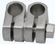
Tube to Tube Clamp 11 x 11mm