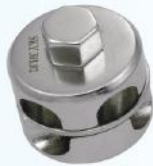
Rod To Rod Clamp 8mm x 8mm