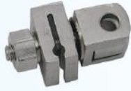
A. O. Type Clamp 2.5mm x 4mm