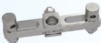
Transverse Pin Adjusting Clamp