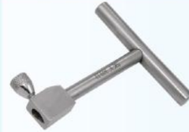
"T" Handle For Schanz Screws / Steinman Pin