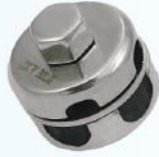
Aesculap Clamp 4.5mm x 8mm