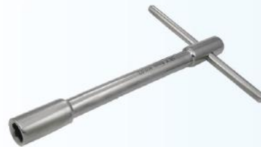
Box Spanner 8mm