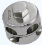
Aesculap Clamp 4mm x 4mm