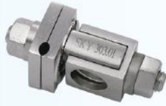
A. O. Type Clamp (Single Pin) 4.5mm x 11mm