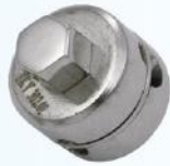
Aesculap Clamp 2.5mm x 4mm