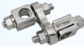
A.O. Joint For Two Rod 11 x 11mm