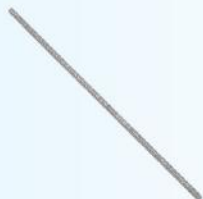
Jess Rod With Serration

Size : 2.5mm x 6" to 12" 3mm x 6" to 12" 4mm x 6" to 12" (Variation - 2")